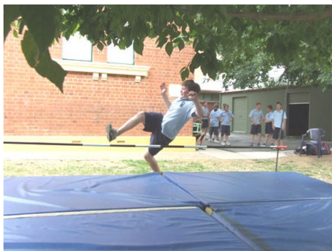
High Jump training for the up and coming Athletics Carnival in term 2.