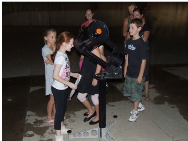
Photo of class 5-6D telescope night from week 6.