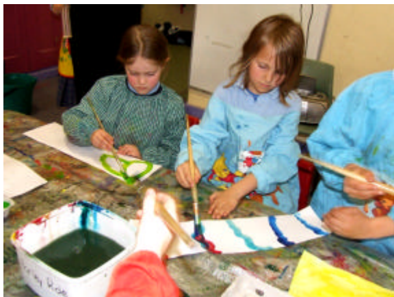
Enjoying art in the Infants.