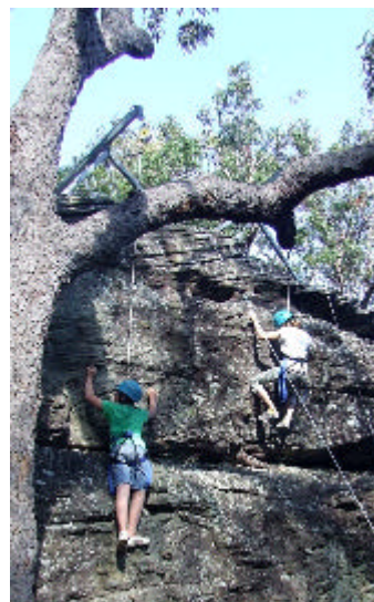
Two more photos of students performing activities at Broken Bay camp.