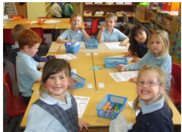
Some students from KE.