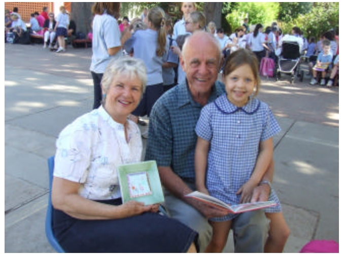
Photos in this issue are of Grandparents Day which was held last Friday.